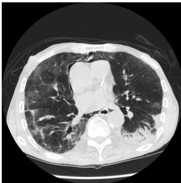
Figure 2. CT scan of chest showing improved opacity of lung parenchyma 2 weeks after discontinuation of daptomycin.

DAEP was first reported in 2007. DAEP is characterized by eosinophilic infiltration of the lung parenchyma ranging from asymptomatic infiltrates to acute respiratory distress syndrome necessitating mechanical ventilation [4]. It is believed that parenchymal damage secondary to destruction of